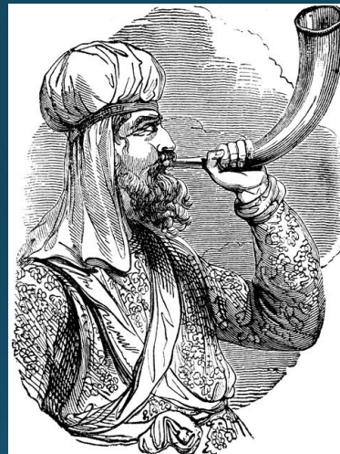
Priests blow horns