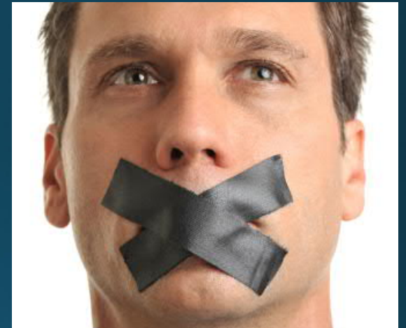
Everybody else says nothing